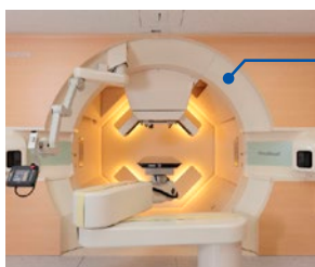
State-of-the-art particle therapy equipment that excels at targeting cancer tissue

We hope to continue collaborating with THK to create better products and help create a better society.