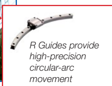
R Guides provide high-precision circular-arc movement