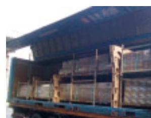
Green distribution Rail container

THK's Distribution Division is engaged in green distribution activities that strive to reduce environmental burdens throughout the entire distribution process. Activities in fiscal 2010 included the review of regular chartered shipping routes and efforts to improve load ratios as well as the modal shift and integration of rail transport routes. As a result of these endeavors, load ratios of chartered shipping routes improved by approximately 10% compared with levels recorded at the beginning of the period.