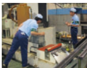
Energy conservation patrol at the GIFU Plant

At the KOFU Plant, air-cooled type air conditioning systems have been replaced by water-cooled type systems.