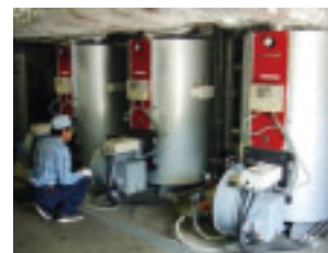
Boiler at the YAMAGUCHI Plant

This initiative has helped cut CO 2 emissions by 17,084Kg annually. In addition, the Plant is promoting the use of LED bulb and LED fluorescent bulb lights, which help reduce energy consumption by approximately half compared with conventional lighting.